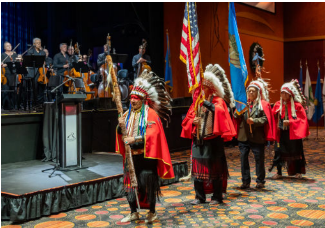
PRESENTATION OF COLORS BY THE KIOWA BLACK LEGGINGS WARRIOR SOCIETY AT THE PROJECT LAUNCH EVENT WITH THE OKLAHOMA CITY PHILHARMONIC IN NOVEMBER 2024.