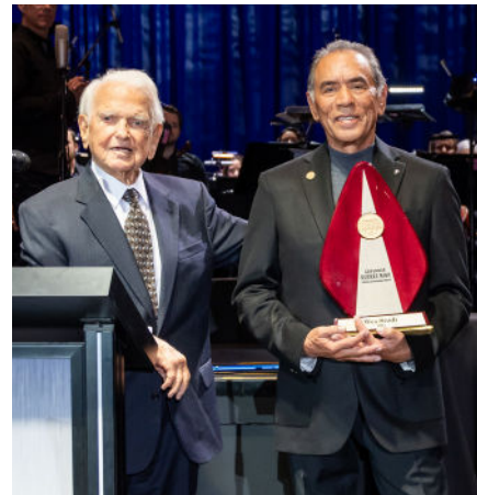
WES STUDI RECEIVES GOVERNOR GEORGE NIGH LIFETIME ACHIEVEMENT AWARD